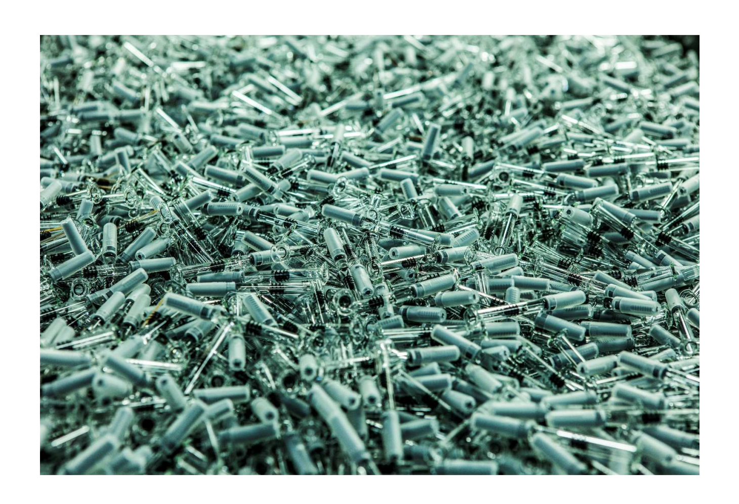
Laboratorios Farmacéuticos Rovi, S.A. and Subsidiaries Investor Relations